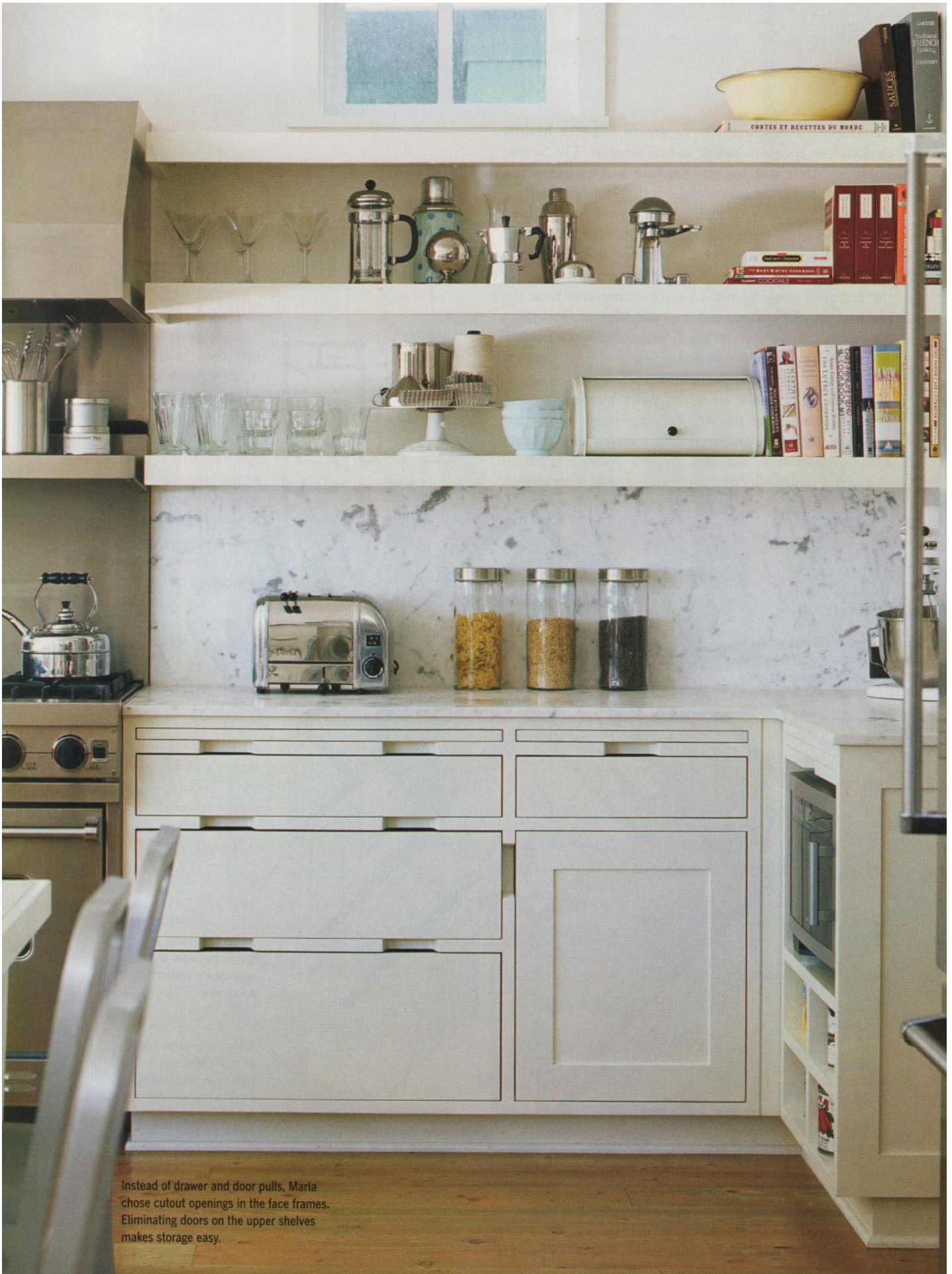
Instead of drawer and door pulls, Maria chose cutout openings in the face frames. Eliminating doors on the upper shelves makes storage easy.