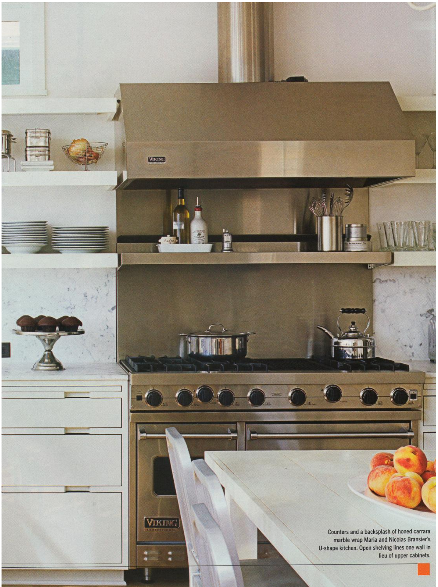
Counters and a backsplash of honed carrara marble wrap Maria and Nicolas Bransier's U-shape kitchen. Open shelving lines one wall in lieu of upper cabinets.