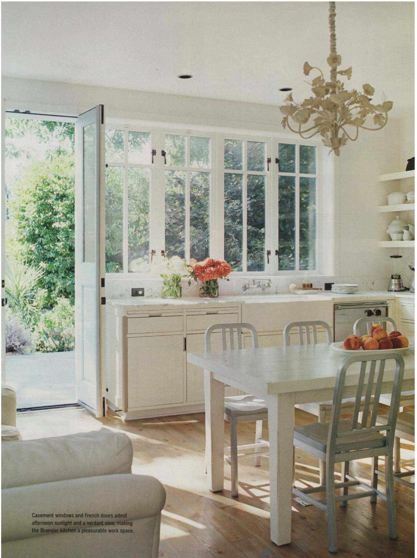
Casement windows and French doors admit afternoon sunlight and a verdant view, making the Bransier kitchen a pleasurable work space.